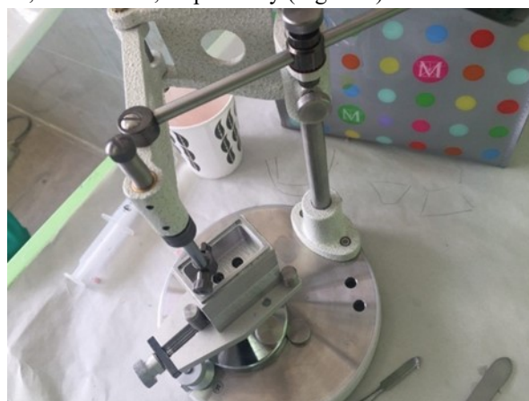
Figure 2. Inserting fixture analogs by surveyor.

Impression Copings, Dentis Corporation, South Korea) so that the head of the impression coping screw would be positioned at least 2 mm out of the hole, making it easy to unscrew the screw from the outer side. The length, diameter and gingival height of the copings were 23, 5 and 2 mm, respectively (Figure 2).