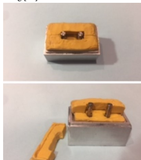
Figure 5. Putty index for splinting of analogs.

Assif et al reported that the impression-taking accuracy increased by rigid splinting of impression copings before taking impressions, which was attributed to the prevention of separate movements of impression copings during the impression-taking procedure by rigid splinting of the components together [30]. Avila et al , too, reported that splinting improved implant impression taking [31].