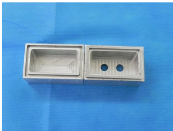
Figure 1. Aluminum Index.

To standardize the samples and the impression-taking process, first an aluminum index was designed by a CNC unit and fabricated (figure 1). The index was composed of two components: segment A (the lower segment) and segment B (the upper segment), which were coupled with male and female parts and fixed. Two holes in the direction of impression copings were placed in the segment B, which played the role of the impression tray; the diameter of the holes was greater than the diameter of the impression copings so that the heads of the impression copings would exit the holes.