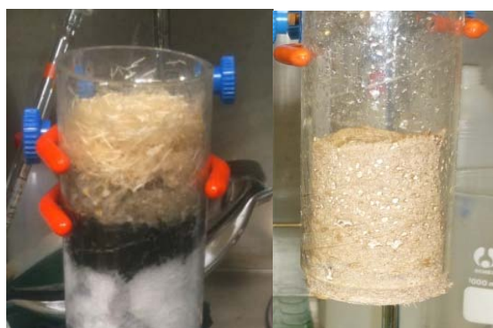
Figure 1. Left, filter with polyamide, active carbon, sand and abaca fiber (bottom to top); right, filter with grinded abaca fiber.

2.3. Production of samples. Samples were prepared by filtering 100 mL of the solution and collecting the filtered liquid. To accurate an adequate conservation of samples after filtration (for metals determination) 100 \mu\text{L} of \text{HNO}_3 1N were added per 50 mL